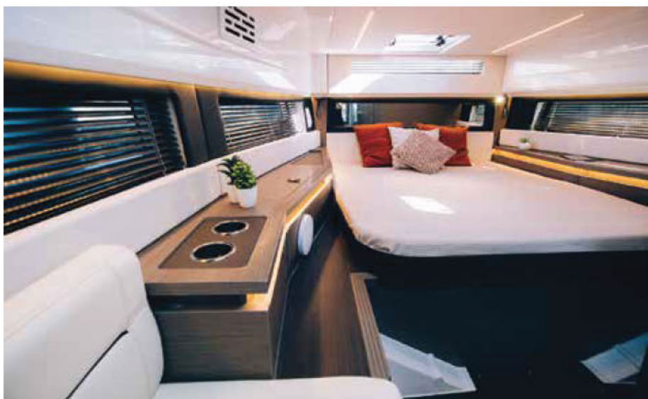
Entry to the below decks is through a companionway set off center to port and down a few steps where we find a centerline double berth plus forward.