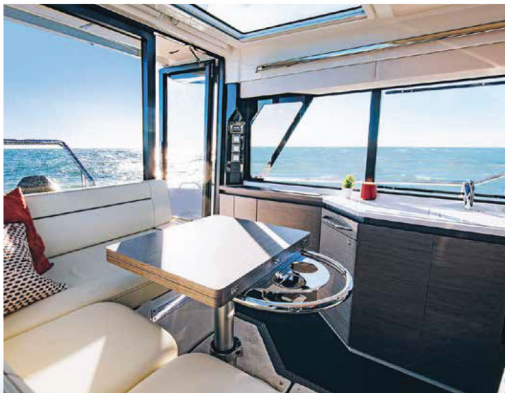
Across on the port side is the mini galley with a single burner cooktop, refrigerator, sink and some stowage. It might be mini, but all of the necessary pieces are there for a weekend away from the dock.

in the cabin. Inside the cabin there is nearly an unbroken 360-degree view from all the expansive glass