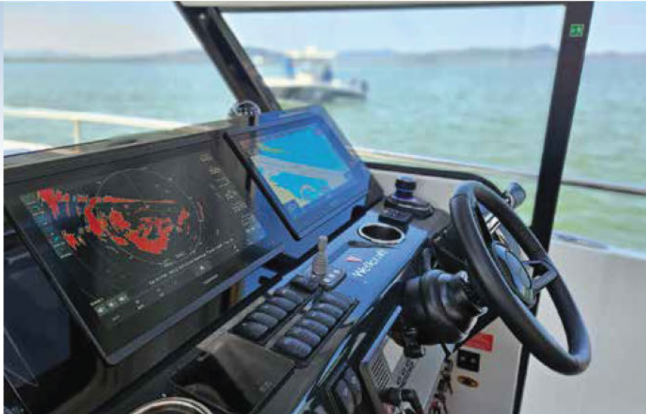
The well-equipped helm is smartly laid out with the dual Garmin flagship 16-inch multi-function displays exactly where I would want them.

Working our way down the calm waters of Potrero Reach I get all the SOG vs. RPM numbers, and by the time we are ready to make