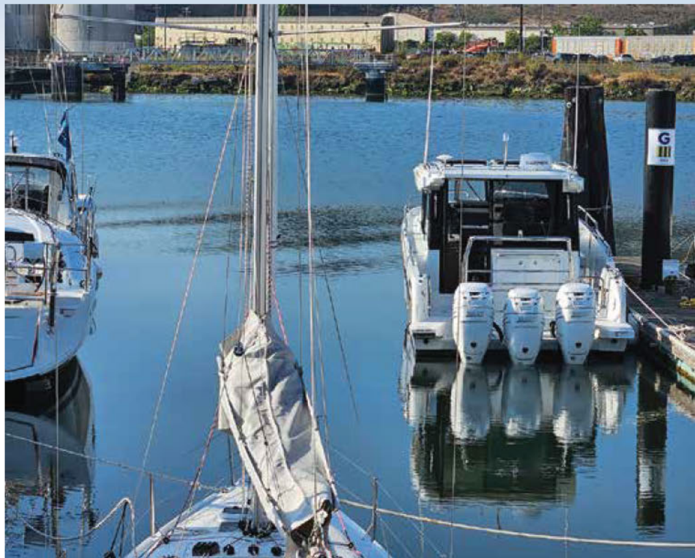
Our 355 is side tied at the end of “G” dock and cockpit is accessed from either side by stepping around the trip mercs and passing through either of the polished stainless transom gates.

Our 355 is side tied at the end of “G” dock and access to the cockpit is from either side by stepping around those trip mercs and passing through either of the polished stainless transom gates. The massive stainless steel combination roll bar, ski tow mount and fender rack make for a perfect grab handle when stepping aboard. At the aft end of the cockpit and just forward of the fender stowage there is seating for three, forward is plenty of room to move around the cockpit and on the starboard side forward is a countertop with