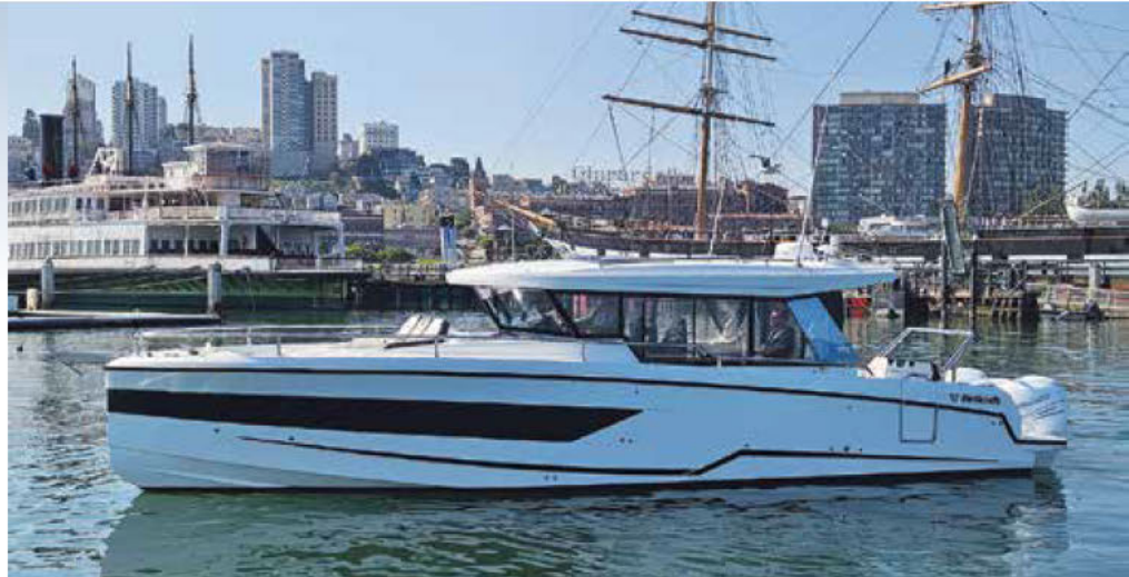
They might call her a 355, however the length overall is nearly 39 feet and with the large rectangular windows of the house and plumb bow she looks even longer than that.

"We are beyond excited to welcome the NAOS Yachts San Francisco Bay office as one of the newest tenants of the Maritime Centre in Point Richmond," says