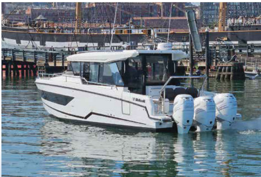
As you approach from the quarter she looks long and sleek.