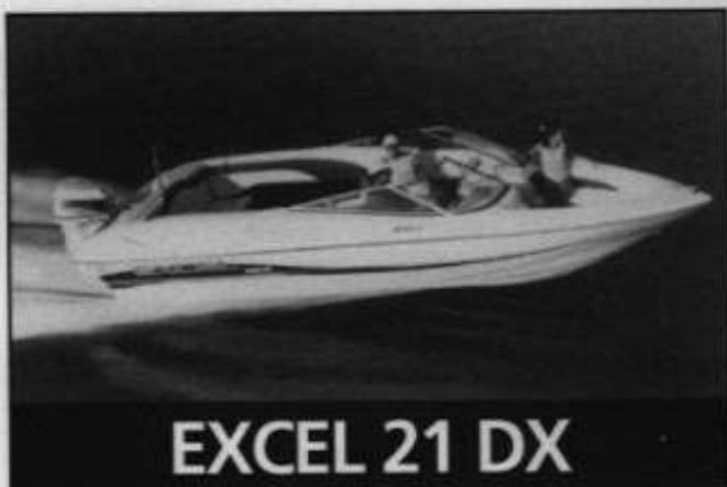
EXCEL 21 DX